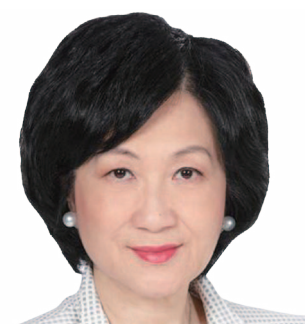
行政會議成員 葉劉淑儀議員, GBS, JP The Hon Mrs Regina IP LAU Suk-ye, GBS, JP Executive Council Member