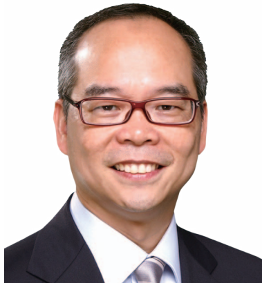
民政事務局局长劉江華先生, JP The Hon LAU Kong-wah, JP Secretary for Home Affairs