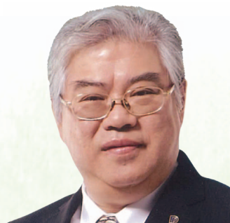
立法會議員 黃定光議員, GBS, JP The Hon WONG Ting-kwong, GBS, JP Legislative Council Member