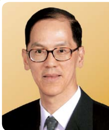
民政事務局局長 曾德成先生

The Hon TSANG Tak-sing, JP Secretary for Home Affairs